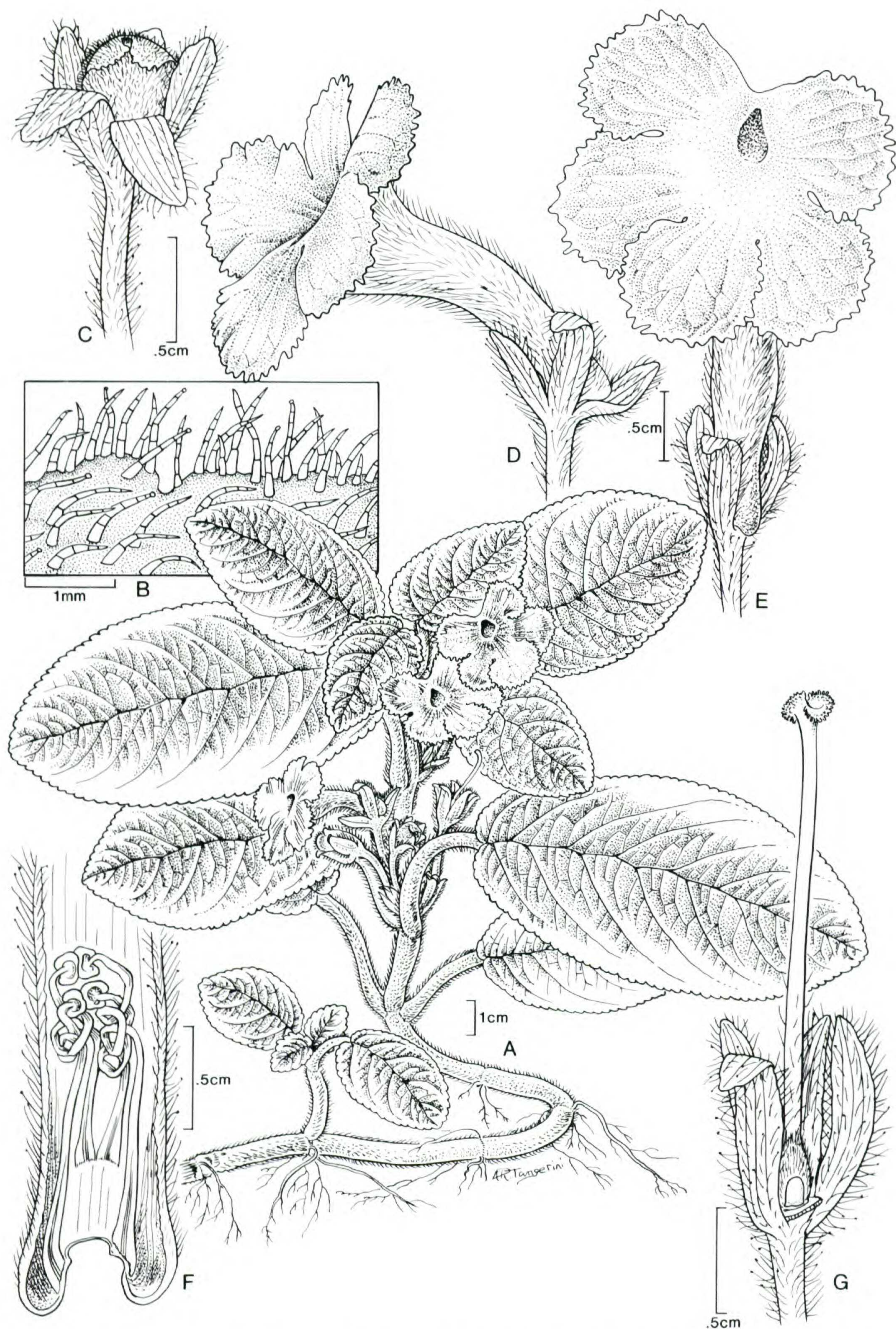
Figure 4. Nautilocalyx chimantensis . —A. Habit. —B. Leaf surface. —C. Flower bud. —D. Flower. —E. Flower (face view). —F. Corolla opened with stamens. —G. Flower with corolla and stamens removed, with calyx, pistil, and nectariferous gland. (A, C–G from Steiermark 75408; B from Steiermark 75473.)